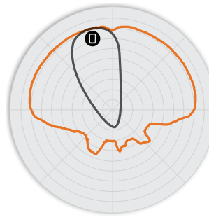
Figure 4. H320 2.4GHz Elevation Antenna Patterns