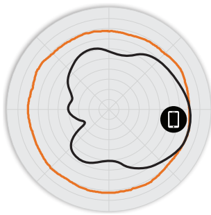
Figure 2. H320 2.4GHz Azimuth Antenna Patterns