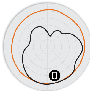
Figure 3. H320 5GHz Azimuth Antenna Patterns